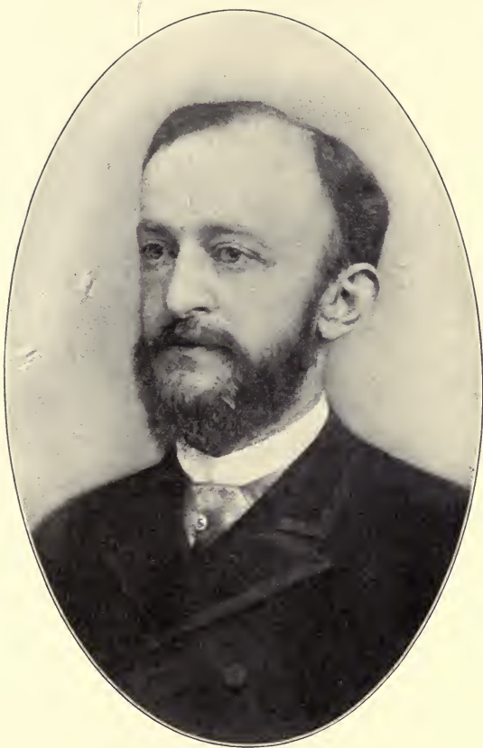
OSCAR S. STRAUS Constantinople, 1888